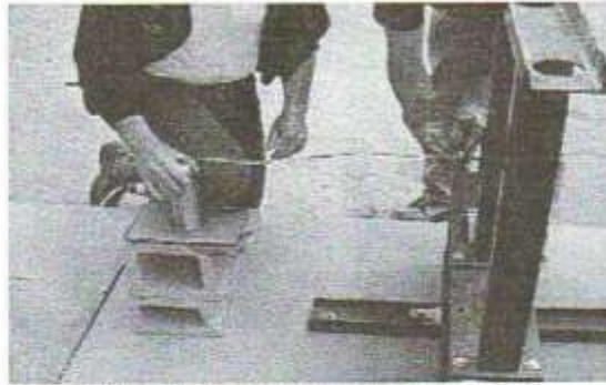
Setting up the test stand for the motors