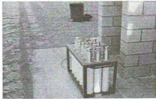
The Motor holding bin prior to static firing