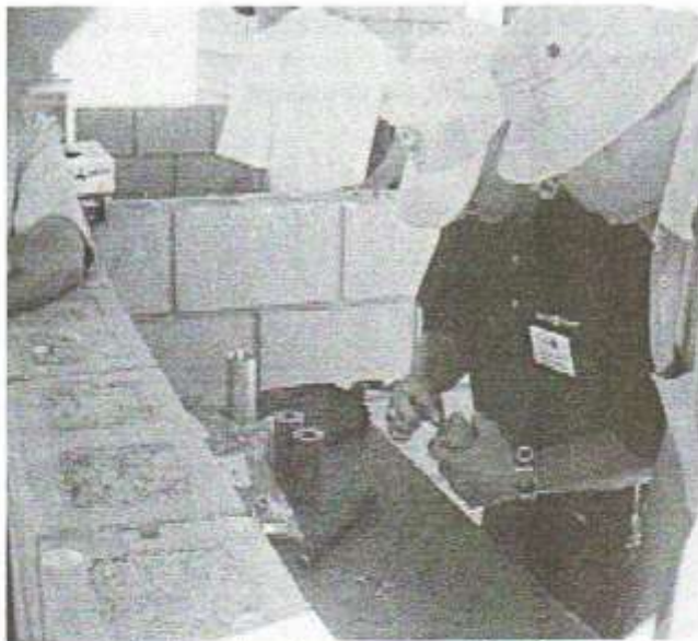
□ Sanding the edges to expose the AP grain