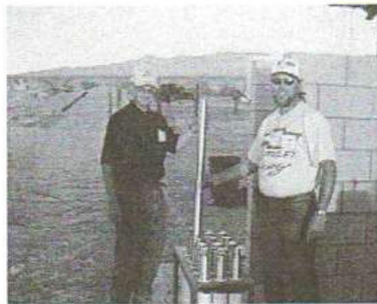
Showing off the finished product