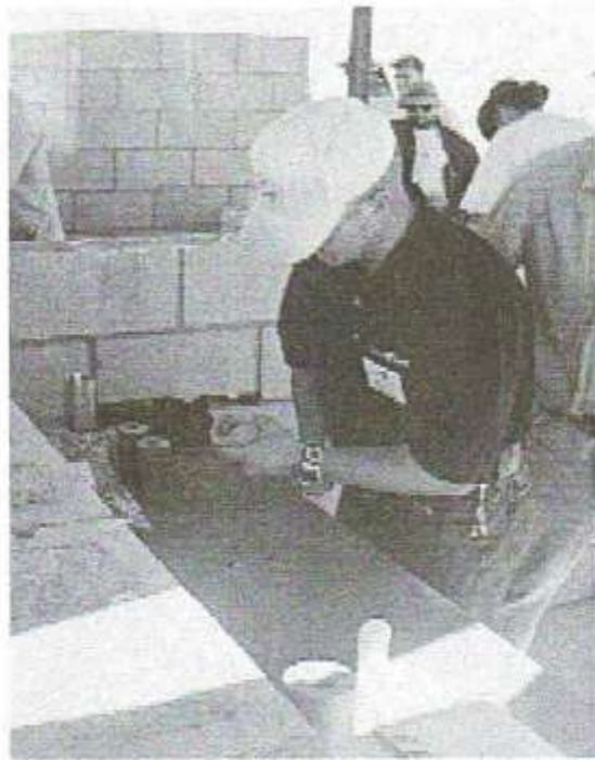
□ Chamfering the core after being drilled out