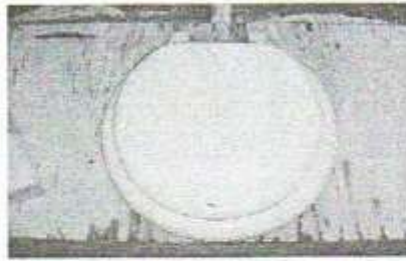
The luxuries of Home.