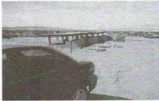
Students in the proper area prior to test firings