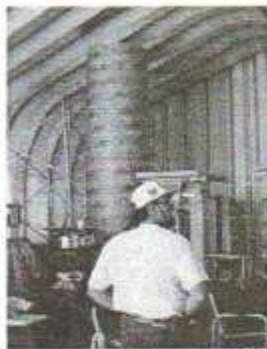
The Sono-tube in the picture would be great for a rocket wouldn't it?

The days activity for Saturday March 18 th , 2000 are the following: