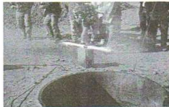
Burning off the excess propellant