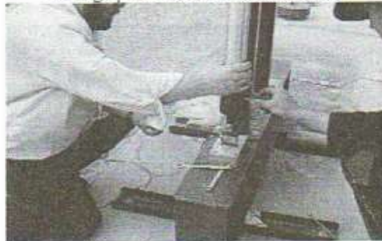
Mounting on the first motor