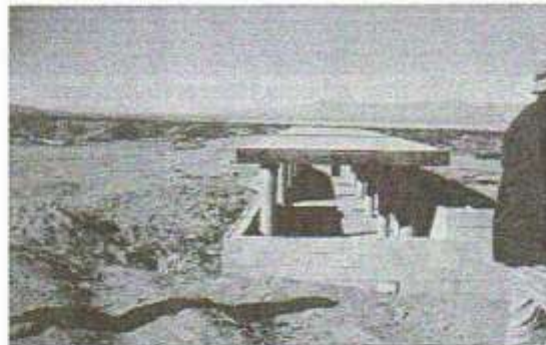
The spectator area prior to the first firing