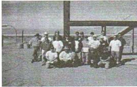
Group Class Picture

If you ever get a chance, and have ever thought about making your own AP motors, you should attend a class like the one offered here at the RRS. Of course you cannot learn everything about solids in just three days, but this is a good course to take, and a good place to start.