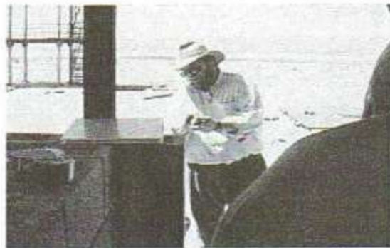
☐ Cleaning off the excess on the outside of the capsules