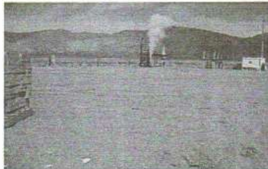
Another static firing