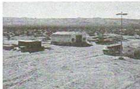
The identifying Building at the MTA site

The MTA is about 21 miles outside of the town of Mojave, just behind Kohen Dry Lake bed.