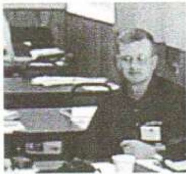
Myself, being attentive.