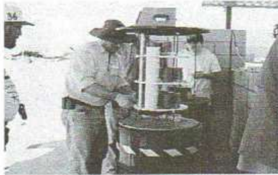
☐ Placing fuel capsules incubator