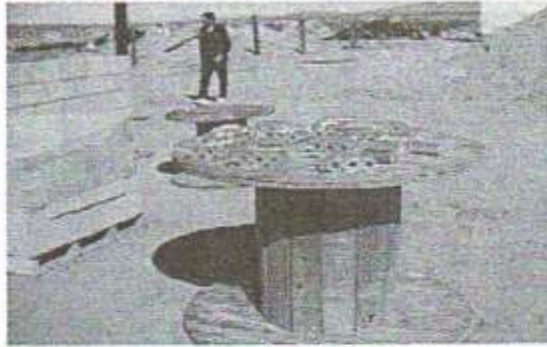
* The grains are prepped and ready for final motor assembly