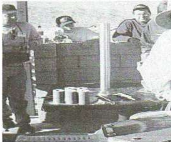
□ Guided discussion on how to load the motor for testing