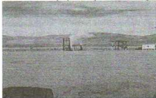
First static firing