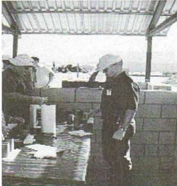
□ Packing fuel capsules area