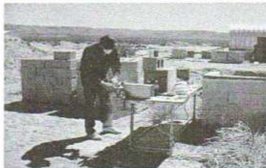
☐ Sanding the edges of the capsules for accuracy