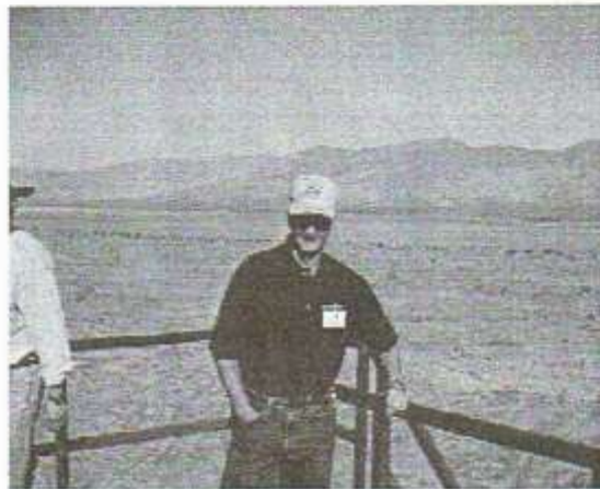
No Body around but us Rocket Enthusiasts